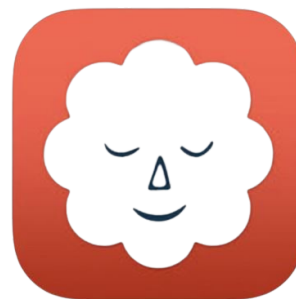
STOP BREATHE THINK